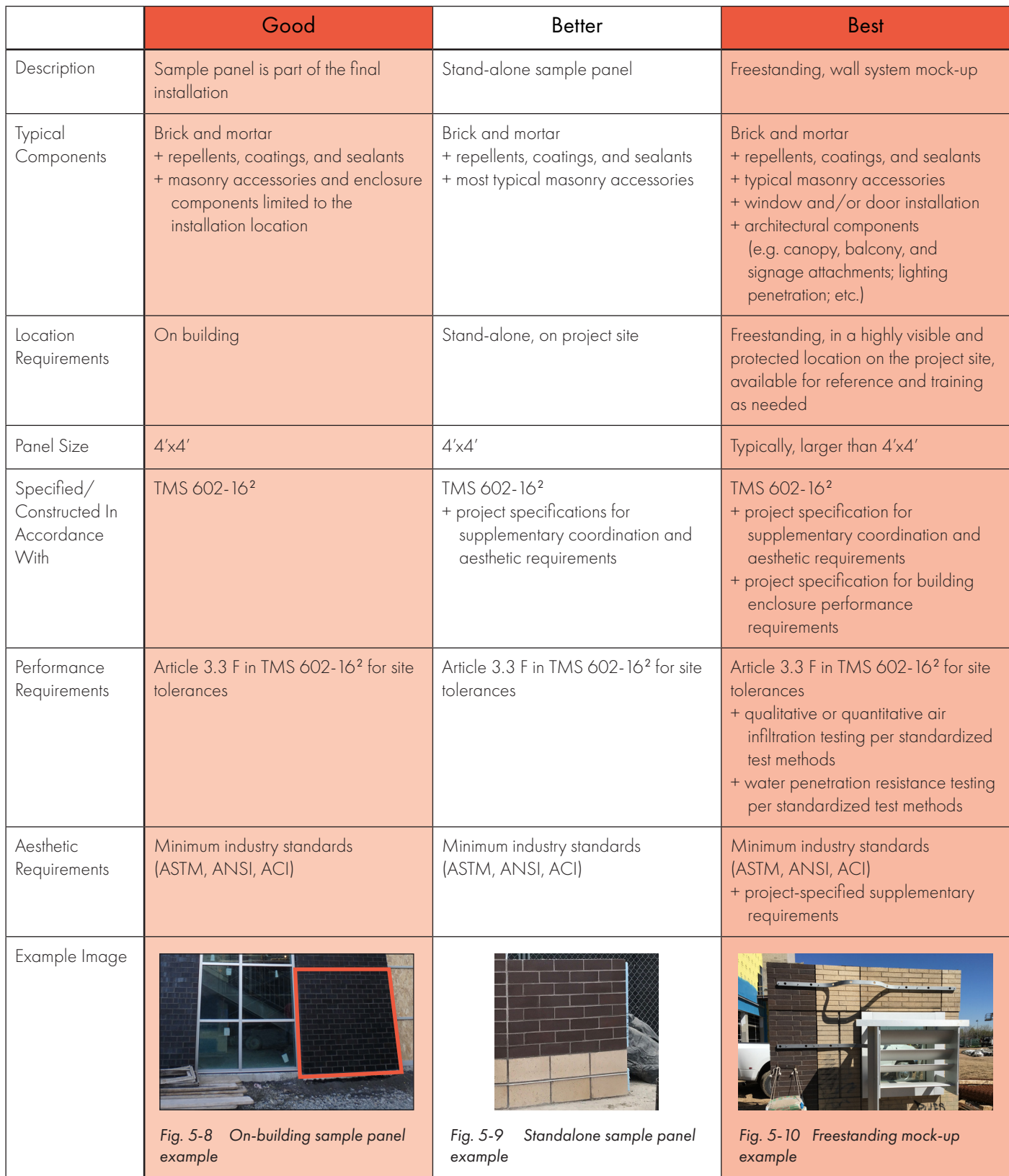
Table 5-1 Summary of Good, Better, Best options for the job site sample panel